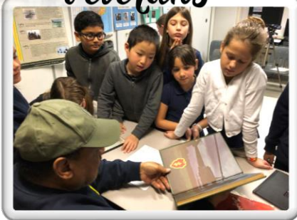
Historical Documentaries: Preserving the Past for Future Generations