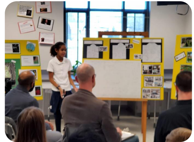
Architecture: What were they thinking?

All students who meet the above criteria are then given the option of taking the CogAT to determine whether they are eligible to participate in the program. Students must attain an Age Percentile Rank (APR) of 90th Percentile as measured by the CogAT or attain a score that falls within an error variance of 89th Percentile—86th Percentile to participate in the T.A.D. program.